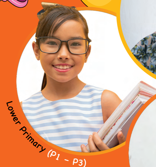
Lower Primary (P1 – P3)