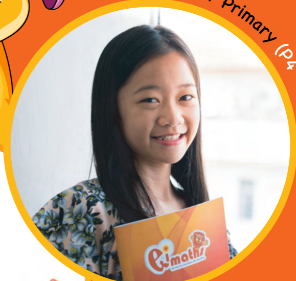
Upper Primary (P4 – P6)