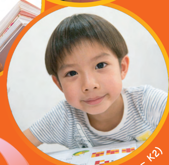
Preschool (K1 – K2)